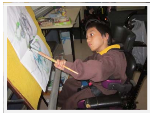
Artist at work.