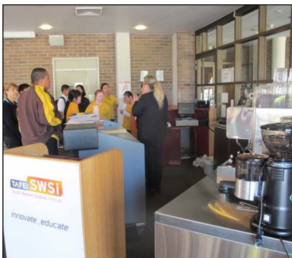
tour of the facilities