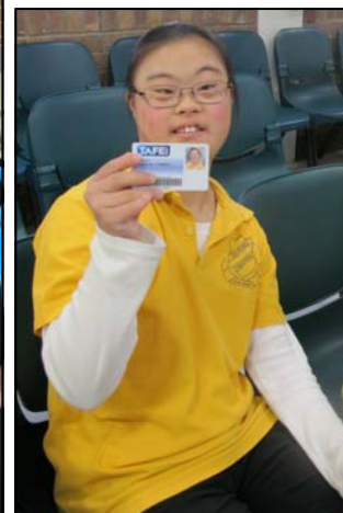
team with ID card &