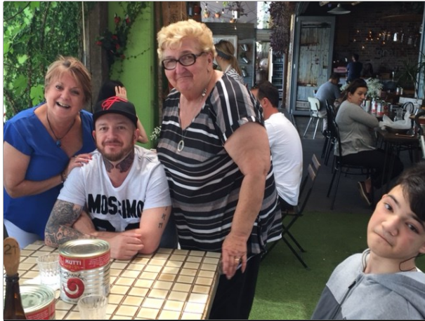
PHOTO GALLERY CARERS' LUNCH